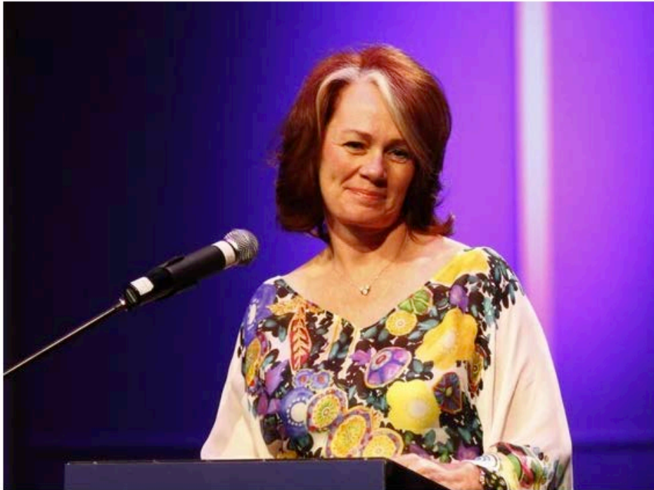
Arlene Dickinson believes entrepreneurs need much better from the federal government.