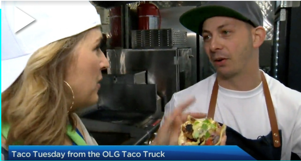
Taco Tuesday from the OLG Taco Truck

Celebrating Taco Tuesday | Global's The Morning Show