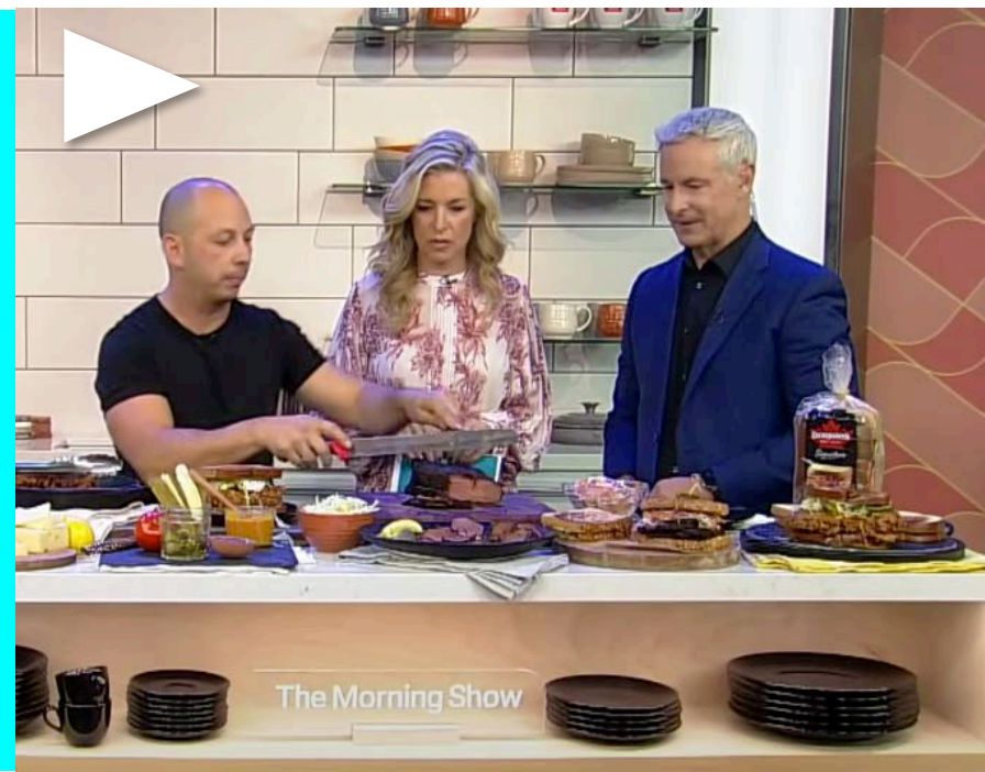
Up Your Sandwich Game | The Morning Show