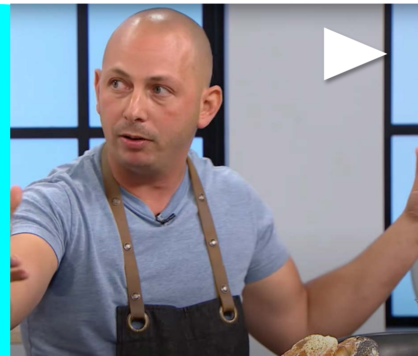
Revisiting Childhood Favourite Foods | The Social

Matt is a regular guest on popular television programs such as Breakfast Television and CTV's The Social .