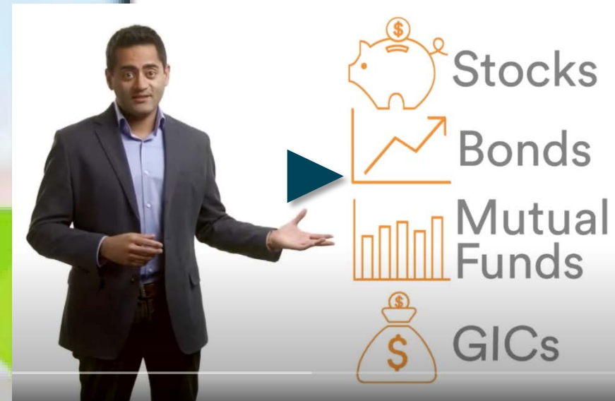
Tangerine – TFSA Video