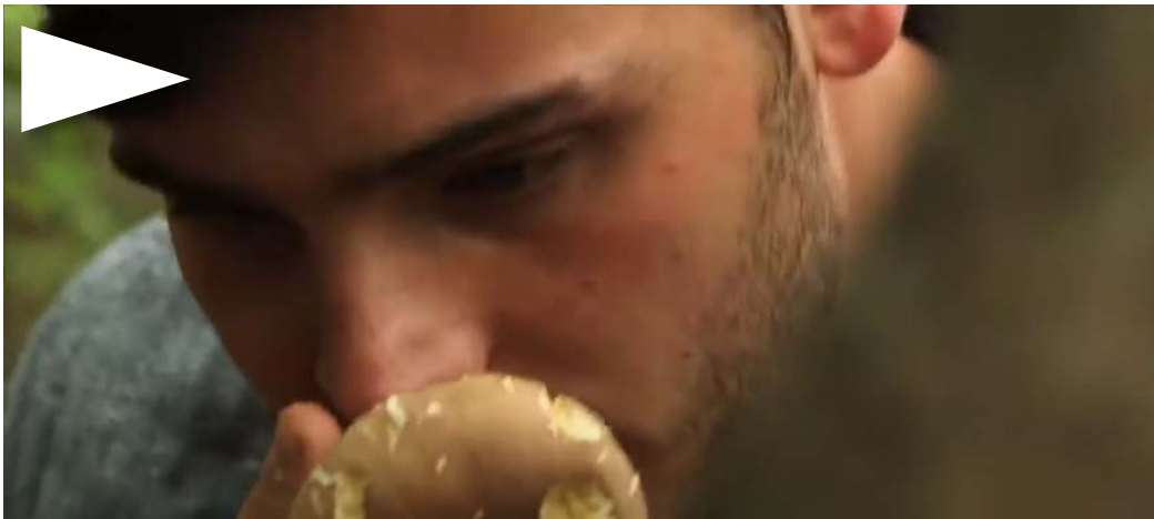
WATCH: Opening Italy - Trailer