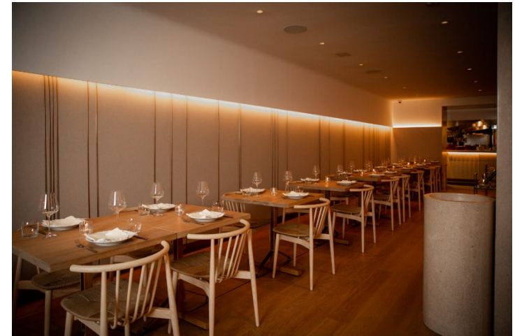
Osteria Giulia, Michelin Starred Restaurant in Toronto