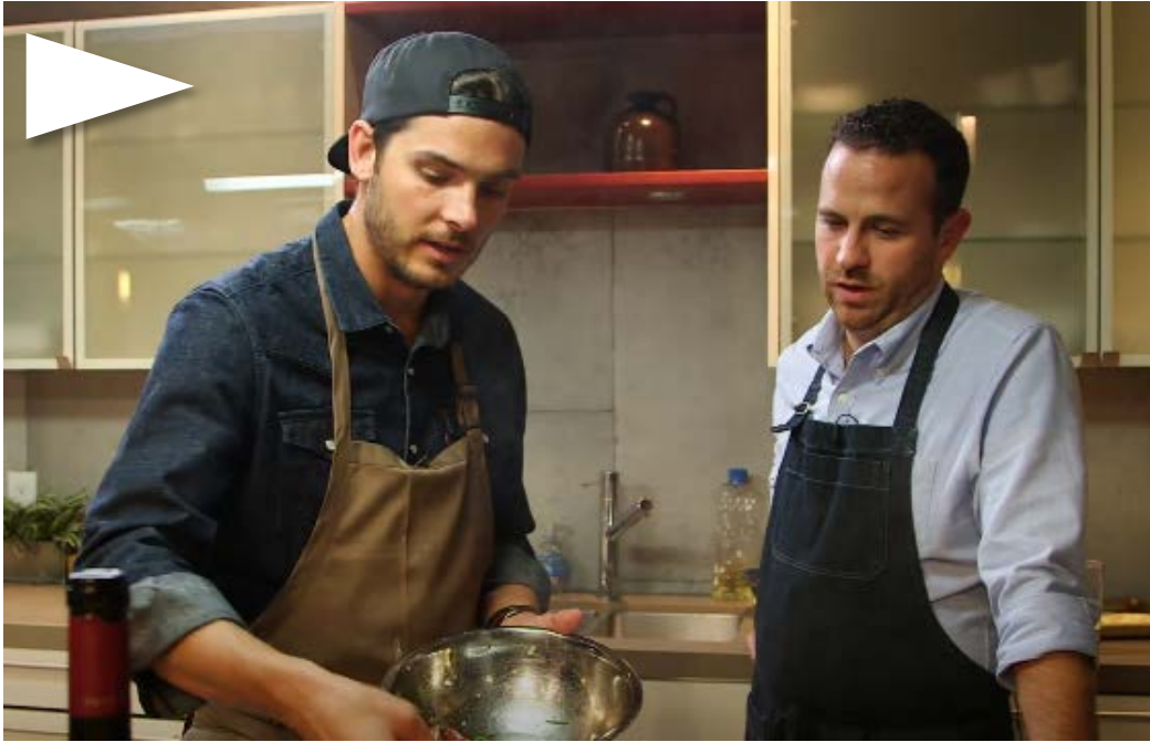
WATCH: The Chef's Bar S1 - Ep1 | Rome