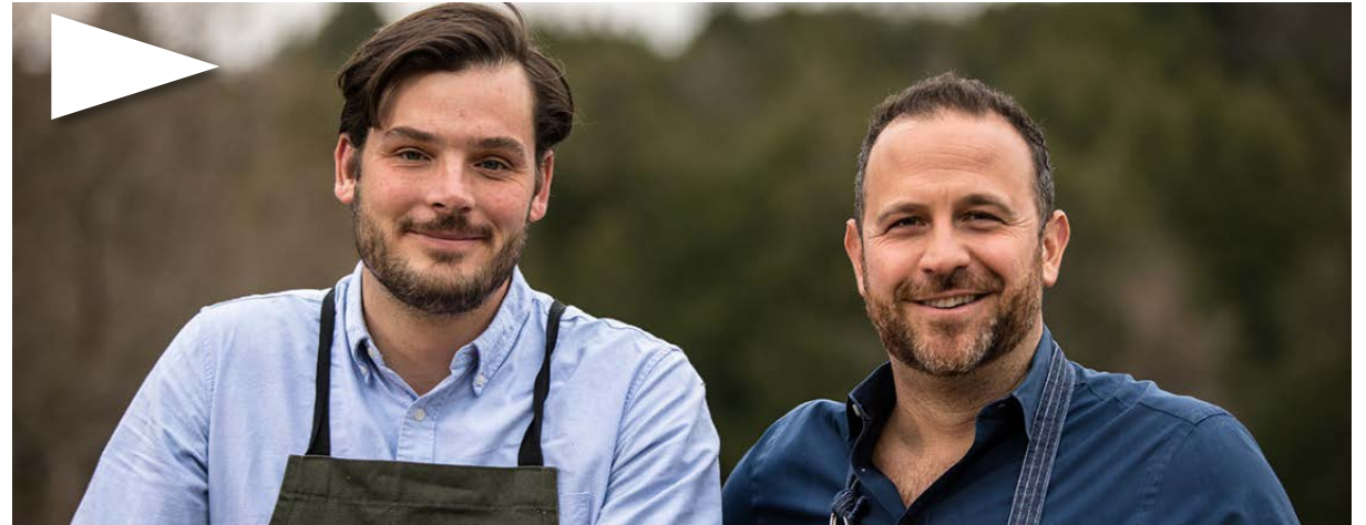
WATCH: Open Fire Trailer - TLN