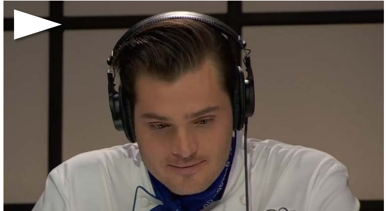
WATCH: Chef In Your Ear Trailer | Food Network