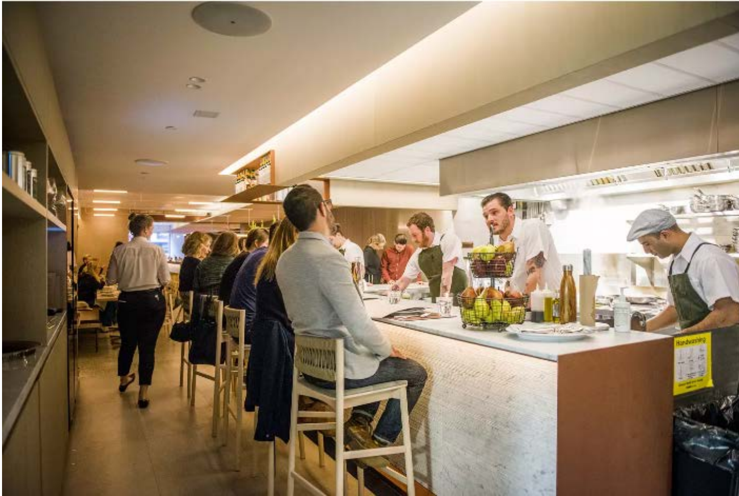
Guilietta, Italian Style Restaurant