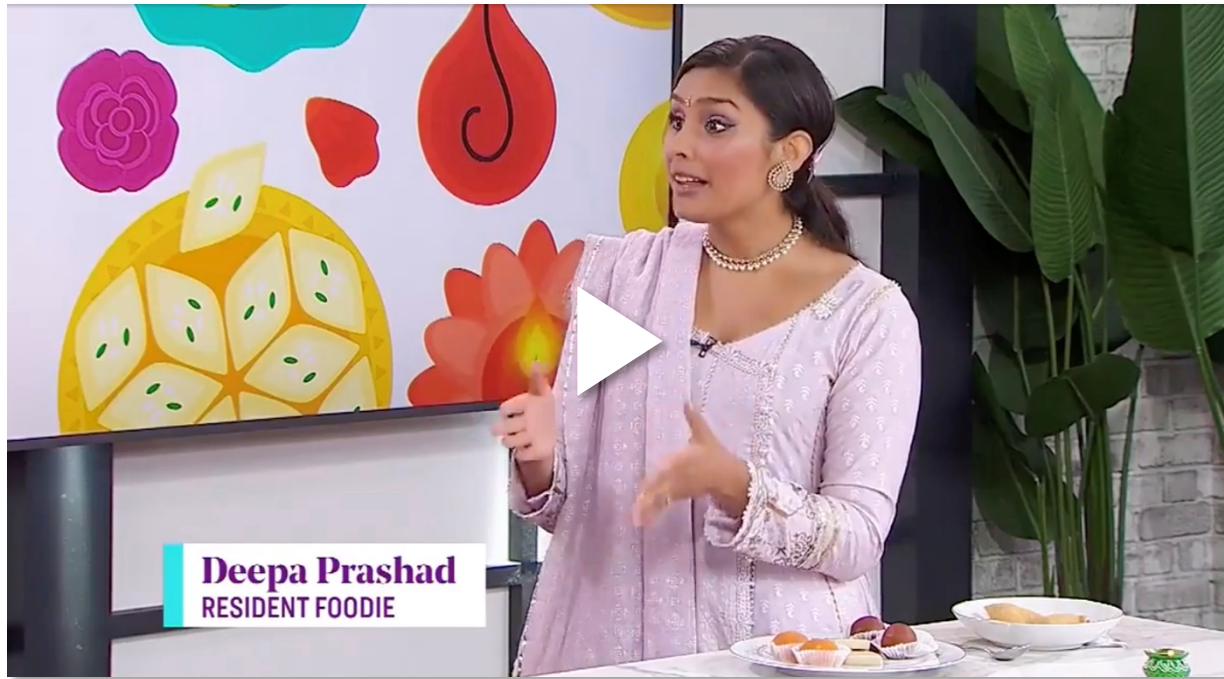
A Guide to the Most Popular Diwali Sweets | Cityline