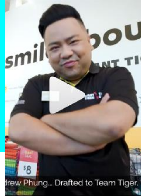
LEFT: Watch Andrew x Giant Tiger