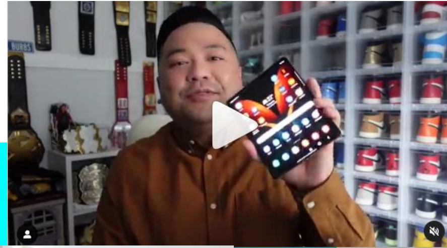
ABOVE: Watch Andrew x Samsung