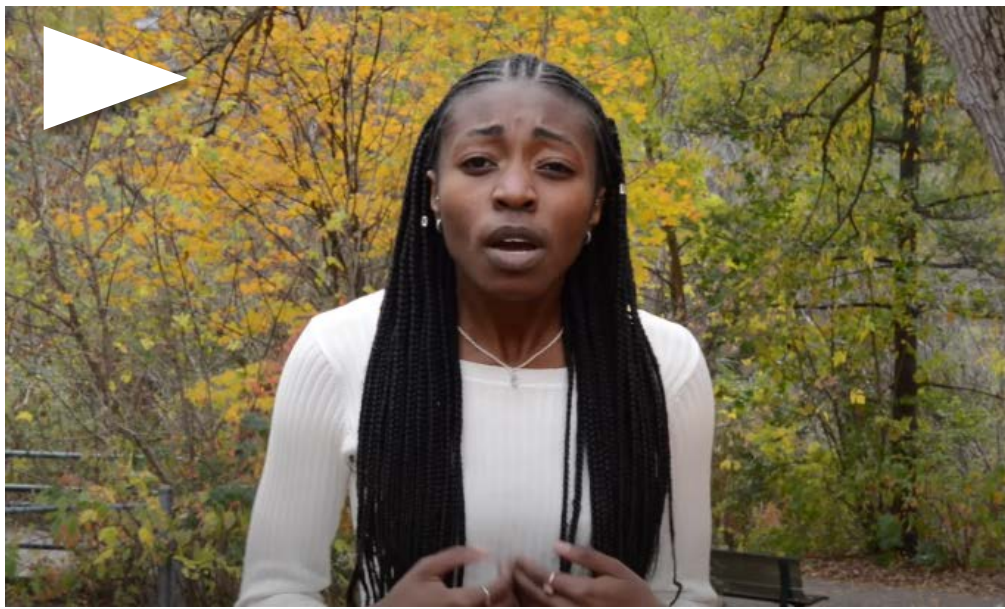
WATCH: Woman, Black | Spoken Word Poetry by Chika Stacy