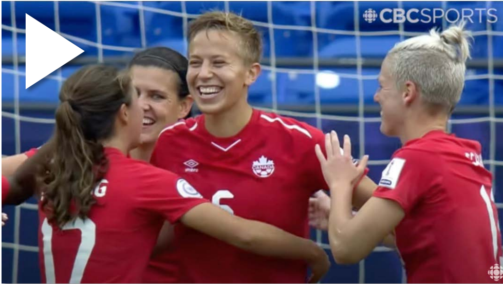
WATCH: Are Sports a Safe Place for Trans People? Quinn Speaks Out | CBC Sports