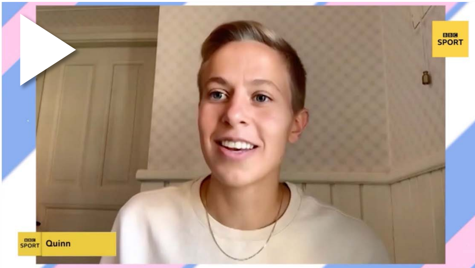
WATCH: On Being "Visible" and Playing at the Olympics | BBC Sport